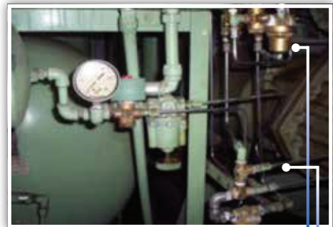
Spiral Valve Inlet Valve Differential